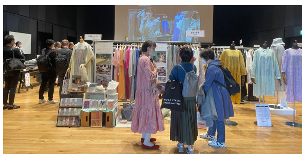
Corporate Revitalization Committee JPF business matching

Promotes the J∞QUALITY certification system to revitalize Japan's textile and sewing production centers, create domestic and international demand for apparel and fashion products, and expand the market.