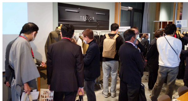
Craftmanship exhibition (JPF)