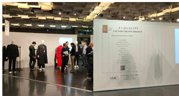
J∞QUALITY FACTORY BRANDS PROJECT "PITTI UOMO"